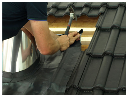
11. Lay the Wakaflex membrane on to the batten and fix in place with nails on the right hand side, left hand side and in the centre.